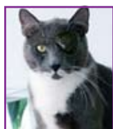
Team Leader: Chairman of the Board Chairman Meow