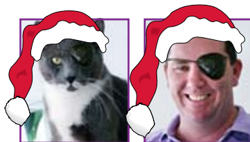
Team Leader: Chairman of the Board Chairman Meow