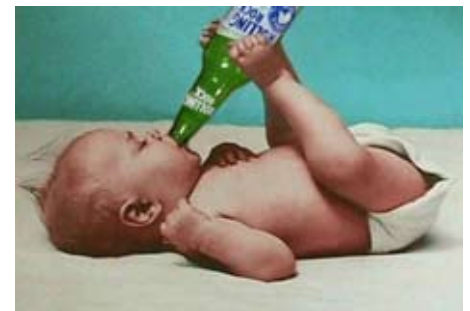
*May not actually be true.