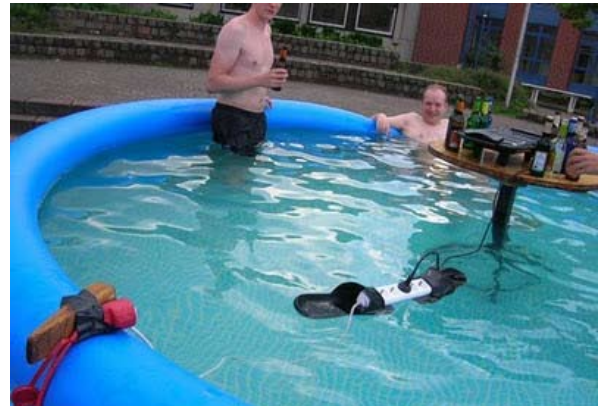
HOW NOT TO STAY COOL