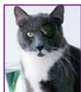
Team Leader: Chairman of the Board Chairman Meow